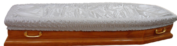
"The Kenmare" - Italian Coffin