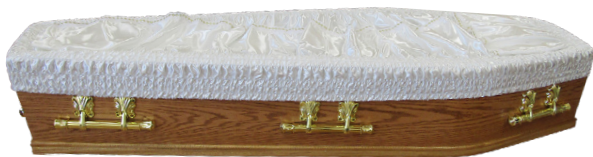
"The Monaghan" - Oval Fluted Oak Veneer Coffin