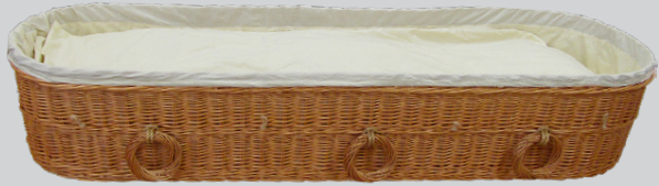
"The Hyacinith" Eco Wicker Coffin