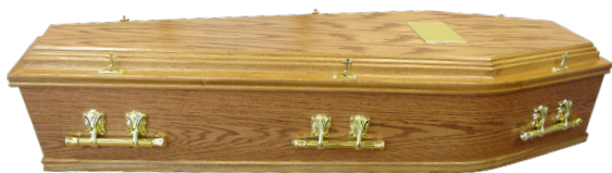
"The Foyle" - Oak Veneer Coffin

In addition to the Simple Wood Effect Coffin (included in the Standard Attended Funeral package) we can supply a range of coffins as below (Prices on Request);